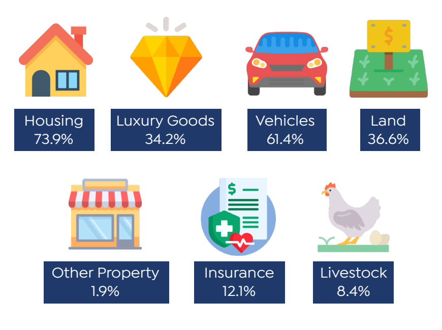
Figure 1: Assets Ownership among People above 40 Years of Age (%)

This changing lifestyle impacted senior citizens to an old-age vulnerability in two perspectives, particularly for those without any retirement income plan. First, they may