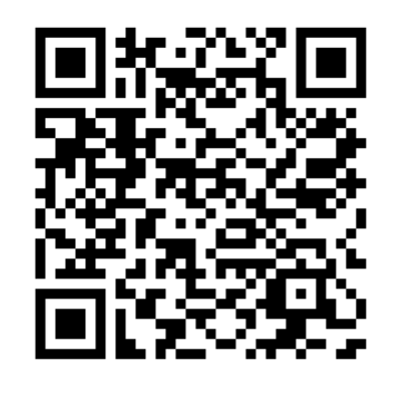
Scan the QR Code to View the Report